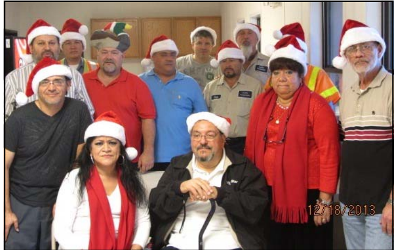
Santa's Helpers - The Laredo Team donned their Christmas best as they waited for Santa.