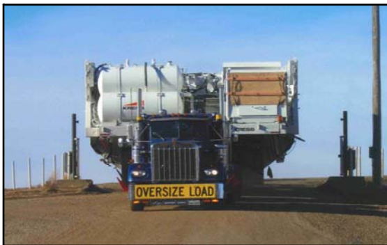
OVERSIZE LOAD! 21' Wide Coal Truck—see page 4

These loads were a real challenge for our engineering team. Calculating the center of gravity of these 16' high loads, with only a 5' 10" base, so that the boilers remained level during transit was a major obstacle to overcome. These boilers are designed to be positioned side by side during operation, therefore securement was extremely challenging. Additional securement locations were added to each end to assist in the side to side securement. Mark Lemon (900216) hauled one of the boilers on a perimeter trailer, while Howard Broussard (900247) hauled the second on a 14-axle trailer. This was Howard's last haul for Lone Star before his retirement on December 31, 2014 (photo on last page).