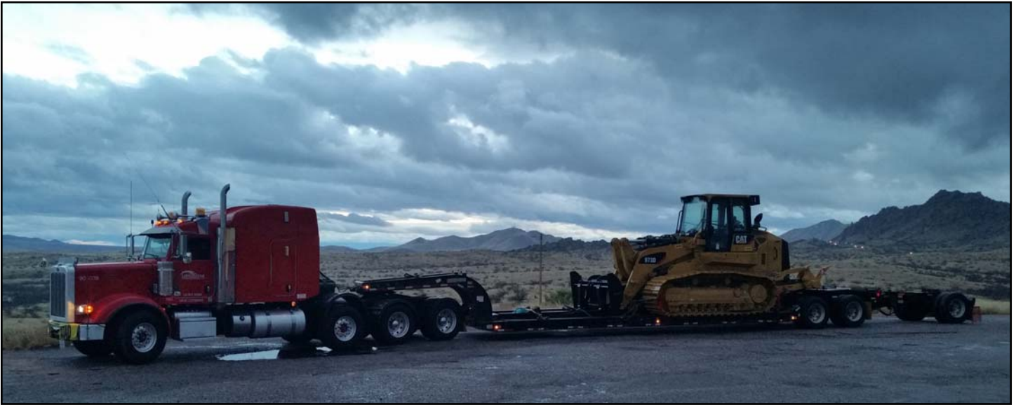
Headed South—Terry Irvin (900309) in Dagoon, Arizona. The 973 CAT Track Loader was loaded in Palestine, Texas to be unloaded in Port Hueneme, California. From there the CAT track Loader's final destination is Antarctica.