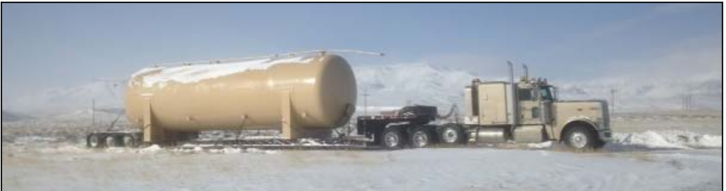
Jason Worthington (3330) hauled this Fresh Water Vessel, with total dimensions of 122,000 pounds, 90' long x 13' wide x 17' high, from Odessa, Texas, to Meeteese, Wyoming. Jason has been with Lone Star for almost 8 years!

Standard of Excellence - Sometimes we feel as if people only notice when we do something wrong ... below are examples reported to the Safety Department of Lone Star Drivers doing something right and maintaining a professional image.