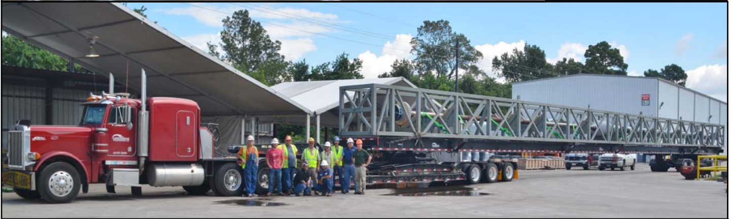
(Below) TL Phillips (8294) , shown with other Lone Star and Shell drivers and escorts, in front of one of three riser joints moved for Shell from Spring, TX, to New Iberia, LA. The loaded dimensions were 200' long, 10' wide, and 14'6" high, weighing 231,000 pounds. TL has been with Lone Star since January 5, 1995.

Standard of Excellence - Sometimes we feel as if people only notice when we do something wrong... But below are examples reported to the Safety Department of Lone Star Drivers doing something right and maintaining a professional image: