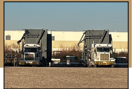
Kenneth Cantwell (featured left) and Clifford Jager (featured along side Kenneth right above) hauling coolers from Houston, TX to Rankin, TX with loaded dimensions of 26' 3" x 15' 6" x 18' 6" and with a gross weight of 35,000. Kenneth has been with Lone Star since January 2005 and Clifford has been with Lone Star since September 2009.