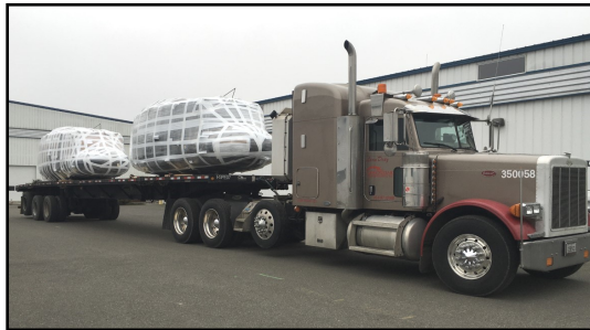
Leon Diaz hauling a 1969 and a 1974 model helicopter (featured above) from Olympia, WA to Ozark, AL with loaded dimensions of 12' 6" x 8' 6" x 8' 6" and with a gross weight of 2600. These helicopters will be refurbished, dismantled and rebuilt. Leon has been with Lone Star since February 1997.