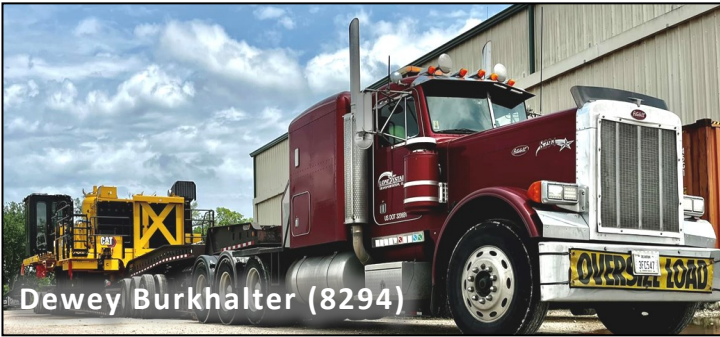
Dewey Burkhalter (8294)

Check out more of our hottest attractions on the LST Facebook page, where we showcase photos daily!