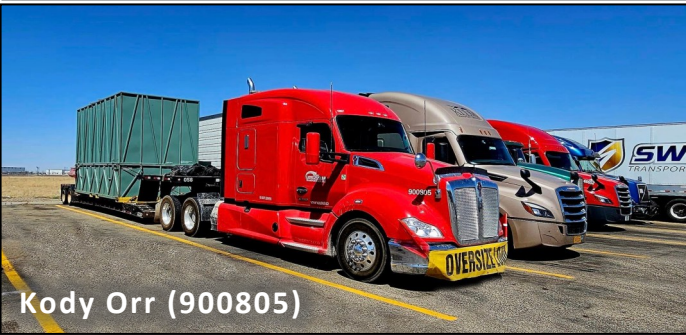
Kody Orr (900805)