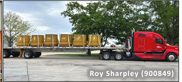
Roy Sharpley (900849)